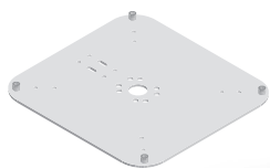
MOUNT ADAPTER PLATE

The maritime pedestal adapter plate enables customers to install the Peregrine u8 on their existing VSAT mount without customizing or replacing their existing pedestal. Kymeta partners with Seaview Global to provide maritime mounting solutions. Refer to https://www.seaviewglobal.com/pages/mounting-solutions-for-kymeta-antennas for more information.