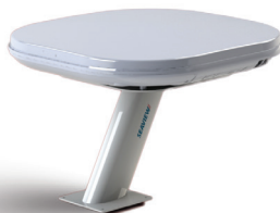
EXAMPLE OF THE PEREGRINE u8 INSTALLED ON AN OFF-THE-SHELF PEDESTAL

* Specifications as of August 2023. Subject to change.